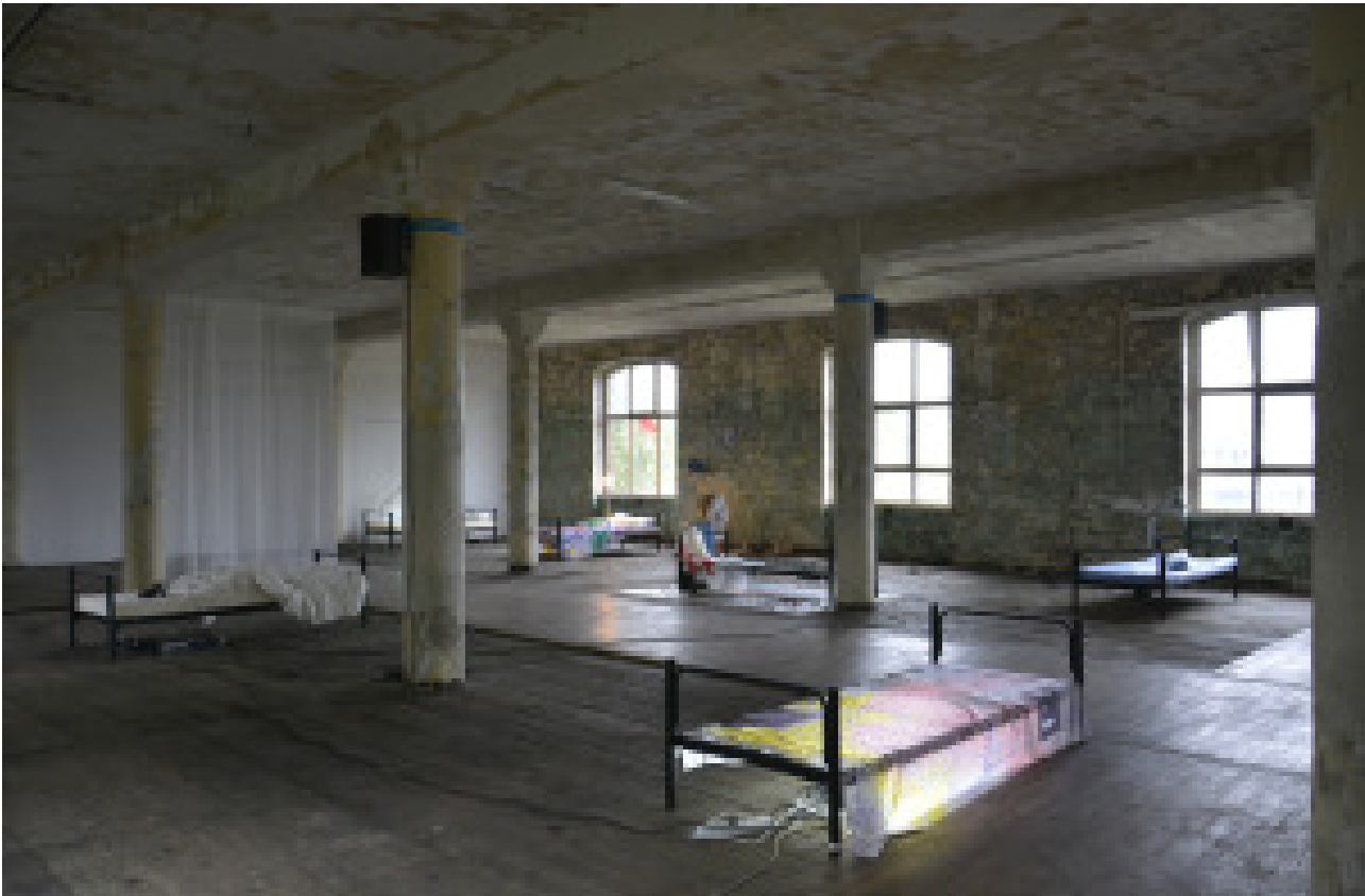
EDENunlimited:tbc.tbc (2014) @ Alt Stralau 4. Exhibition view.

Emphasising audio, each of the 13 installation pieces on show have its own aural composition. Technology varies, ranging from a pair of subwoofers, that seem to be hooked up to two-stroke engine oil, erratically amplifying dialogue from de La Tour du Pin and Renard's 'I Do It So It Feels Real' (2014); to a variety of dinky portable MP3 docks; to several straggly in-ear headphone sets. At the far end of the room, a performer reinterprets Jacques Roger's 'Audio File' (2014) on an acoustic guitar. His quiet strumming rises above the conglomerate noise of the show evaporating gently a moment or two later. In addition, the general sound system, a constantly changing, continuous layer in the exhibition ambience, throws a shroud over the space, at times dominating, or sublimating to, the individual pieces.